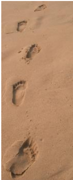
Photograph: The impressions of the Holy Feet of our Guru Swami Bodhananda *****

- Aum Sri Gurave Namah - - Aum Sri Bodhananda Paramaatmane Namah -